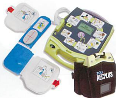
Zoll AED Plus (3 for sale at $1500/ea)