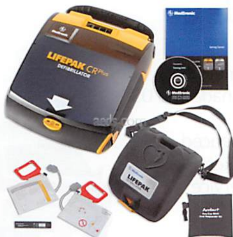
Lifepak CR Plus AED (3 for sale at $1500/ea)

https://www.OttawaParamedics.ca/merchandise/