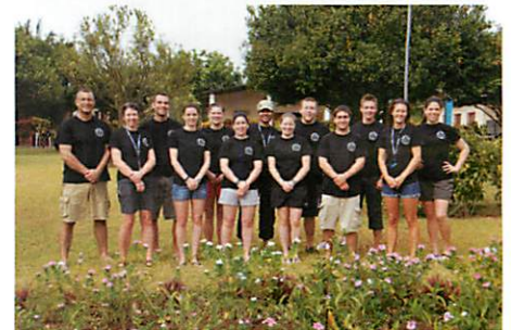
Ottawa Paramedic Nicaragua Team.

We would like to recognize the members of our service who went to Nicaragua on their own time and funds, an amazing accomplishment to all!